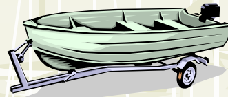
All Boats and Boat Trailers must enter through the Visitor Gate!

needs to check for current decals and ensure the boat and/or trailer belongs in the Village.