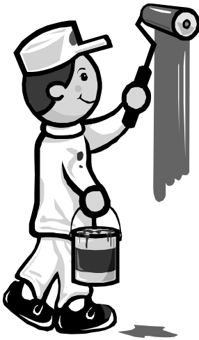
The BBV Office is getting a facelift.

Due to the dredging work in August a piece of the playground area at Recreational Area #4 (Lighthouse Park) had to be removed and will be relocated.